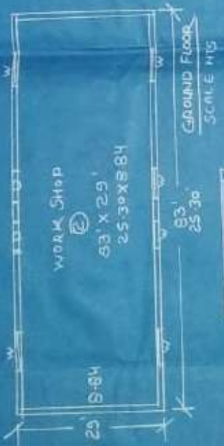
GROUND FLOOR SCALE HTS